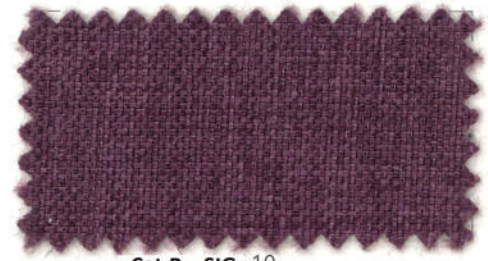
Cat.B SIG 10