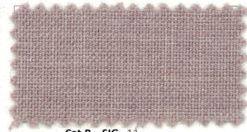
Cat.B SIG 11