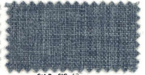
Cat.B SIG 12