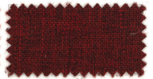
Cat.B SIG 09