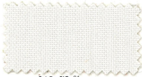
Cat.B SIG 01