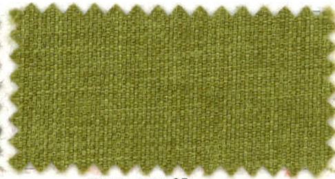
Cat.B SIG 05