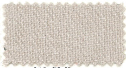
Cat.B SIG 02