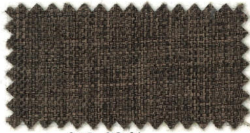
Cat.B SIG 04