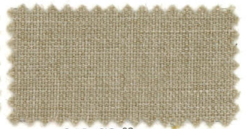
Cat.B SIG 03