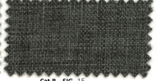
Cat.B SIG 15