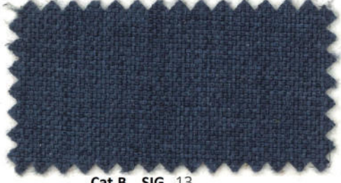
Cat.B SIG 13