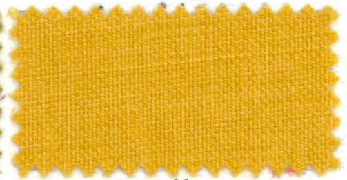
Cat.B SIG 06