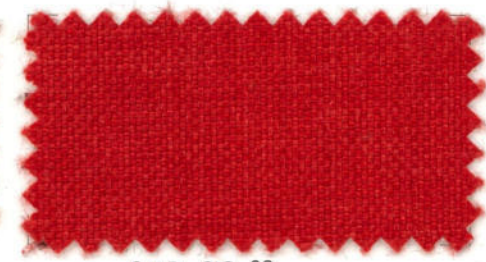
Cat.B SIG 08